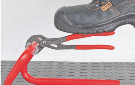
Teeth set against the direction of rotation have a self-locking effect and prevent slipping on the workpiece.