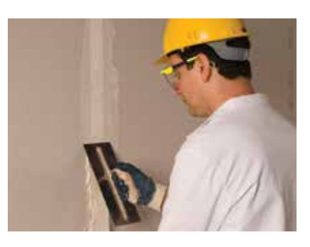
Where there is an increased risk of cracking, or where joints exceed 3mm, the joints are reinforced with Gyproc Paper Joint Tape bedded in Gyproc plaster.

Gyproc Angle Bead is fixed to the plasterboard angle by embedding in the finish plaster.